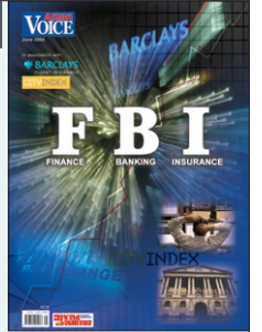
FBI 2005 magazine free with this issue